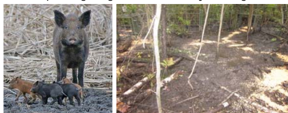
Feral hogs are becoming established in New York, including in Clinton and Washington counties. Their impacts to agriculture, natural areas and human health are far reaching.

Report sightings in the wild to your Regional DEC.