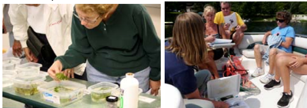
Nearly 700 volunteers attended aquatic plant training sessions and helped to survey 300 Adirondack waters since 2002.

Thank you, Aquatic Volunteers, for your commitment to protect Adirondack waters from aquatic invasive species!